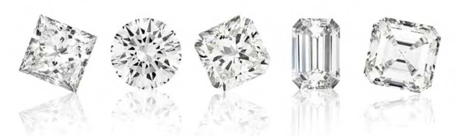
"No, Some are Created Much Better!"

Would you like to offer a diamond that is: